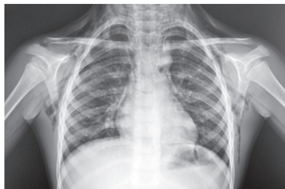
FIGURE 1: Chest x-ray. Subcutaneous emphysema and pneumomediastinum

subcutaneous emphysema spreading from the mandibula down to sternum, ribs and scapula. Hemodynamics and ventilatory parameters including oximetry were normal. Chest x-ray revealed subcutaneous emphysema and pneumomediastinum (Figure 1). Thoracic computed tomography (CT) (Figure 2) and virtual bronchoscopy (Figure 3) revealed subcutaneous emphysema, pneumomediastinum and longitudinal tracheal rupture of 1.5 cm in length, which was 2 cm above the carina at the posterior wall of the trachea. Under close monitorization of clinical and ventilatory parameters a cannula was inserted on the sternum to drain subcutaneous emphysema. He was supported with nasal oxygen during the first day. The patient received 100 mg/kg/day intravenous cephalosporin for antibiotic therapy and intravenous paracetamol for analgesia. The cannula was left for four days to drain subcutaneous emphysema and his control chest X-ray was normal on fourth day. He received intravenous antibiotics for six days. The patient recovered rapidly and he was clinically stable and chest X-ray was normal; he was discharged on sixth day. The patient had no problem in his follow-ups of three years. He was clinically stable, didn't have any respiratory distress or stridor and the chest X-rays were normal during the follow-ups. Informed consent was obtained from the parents of the child for publication.